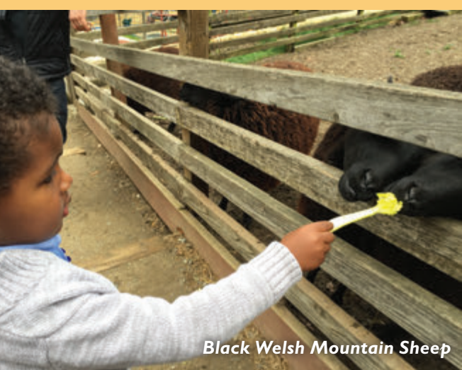
Black Welsh Mountain Sheep